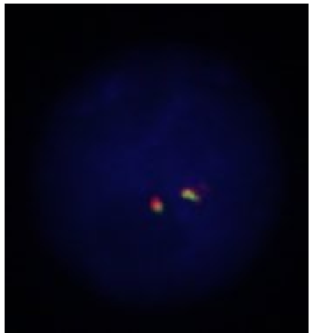
Representative images of normal human cell (lymphocyte) stain with the dual color FISH probe. The left image is chromosomes at metaphase, and the right image is an interphase nucleus.